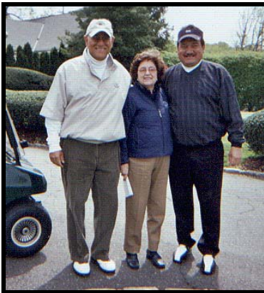
Smiles from Plandome

Phone: 914-347-4653 Fax: 914-347-3437 Email: ESGASSN@aol.com