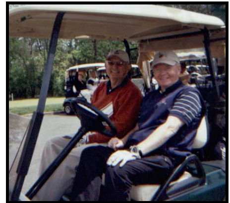
More smiles from Plandome